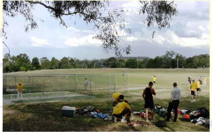
Training. You won't know what you've got 'til it's gone...

Assuming a team wins this weekend, training will be on at Duffy Oval (Dixon Drive) on Wednesday at 5:00pm . Come down if you can and help the boys out. The less I bowl, the less of the batsmen's time is wasted.