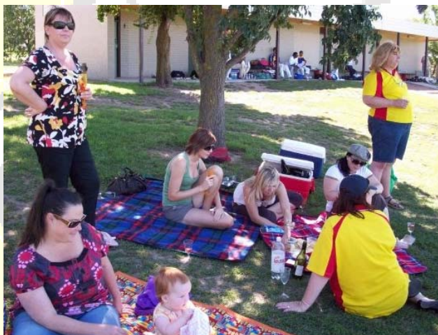
Sometimes a game of cricket even breaks out

Wanderettes! Get your champagne drinking shoes polished and ready for action on Saturday 21 February for the second and final Ladies Travelling Picnic of the 2008/09 season. The cost is $20 per ticket which covers champagne*, lunch, champagne, cakes, champagne, cheeses, champagne, bus hire and did we mention - champagne. Kids and non-drinkers' tickets are available for $10/head. More information will be provided soon. For enquiries in the meantime or to book your seat early, please email Caitlin at: treasurer@wodenwandererscc.com .