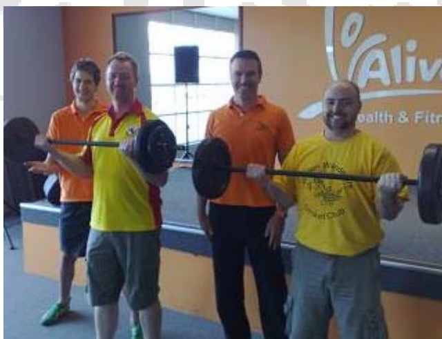
The Prez and VP at Alive Health & Fitness (gritting their teeth)

This year the Wanderers welcome a new major sponsor, Alive Health & Fitness. See the sponsors section below as well as your player handbook for more information on the fantastic player discounts on offer.